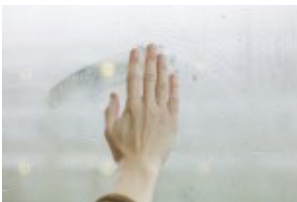
Fake Skin Sends Pressure Signals to Brain Cells