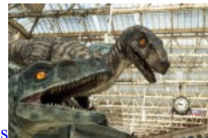
Hot or Not: